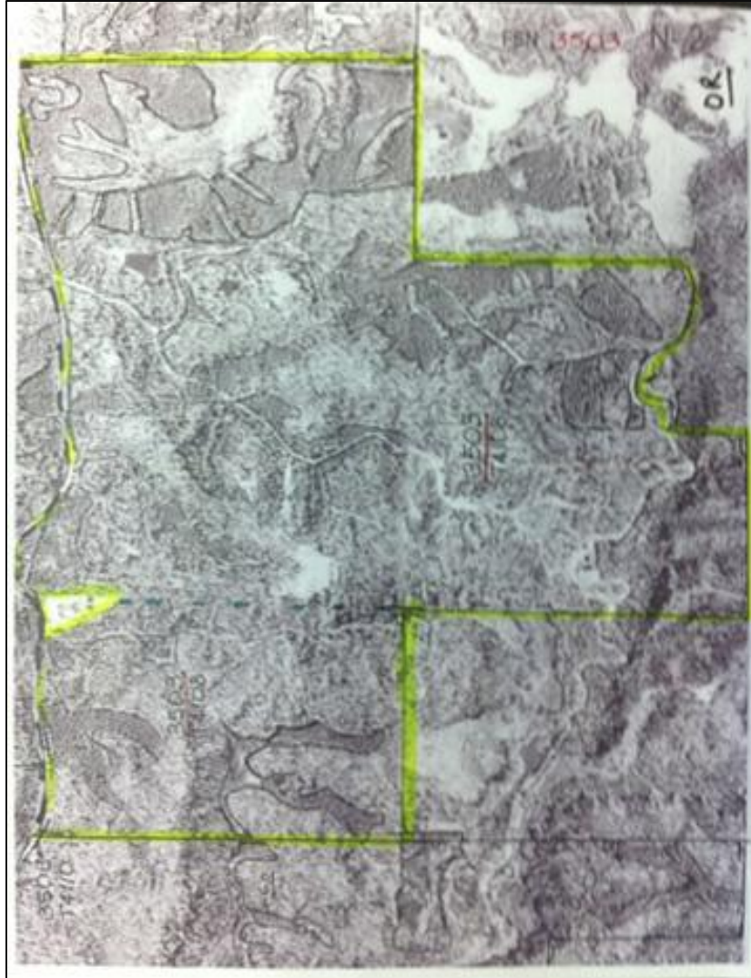
Map of Land Area